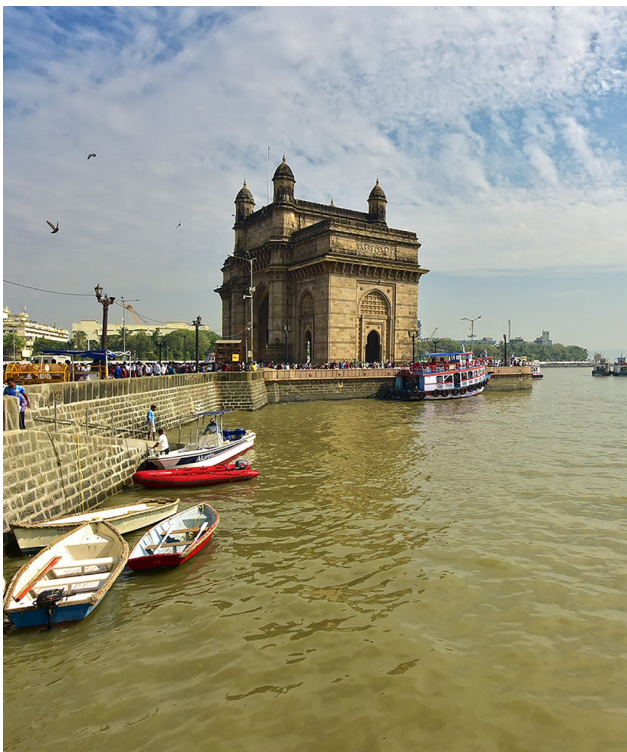
Gateway of India, Photo courtesy: Somnath Datta